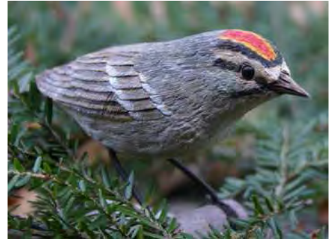
The Golden-crowned Kinglet was seen 4 out of the last 5 years during the Big Sit!

This is the sixth year that the Birds of Vermont Museum is participating in Birding's Most Sedentary Event . We sit or stand in a 17-foot circle in the garden behind the Museum, and record every bird species heard or seen. You may leave the circle often, but can't count birds unless you return to the circle. Lots of food, friends, and camaraderie, and hopefully about 30 species of birds! Dress warmly. This is a fundraiser to help support the Museum. Join us for bird watching or sponsor one of our sitters.