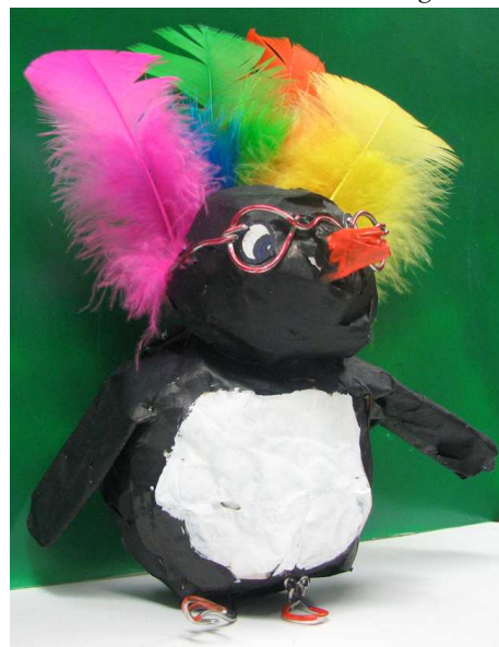
Esme Cole's second place entry in the 3-D category.