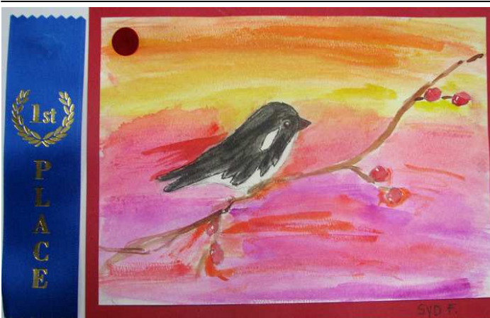
Syd F.'s winning entry in the 6-8 age category.

Looking for a unique gift? Consider a bird case sponsorship.