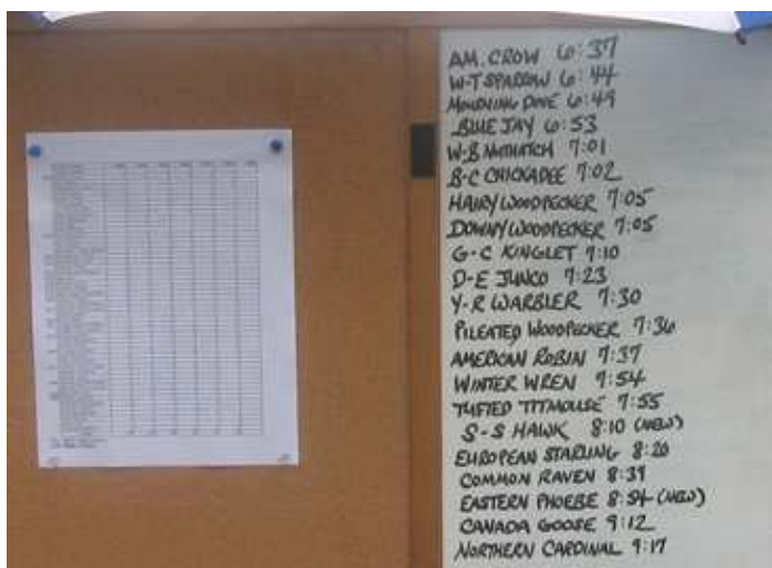
The running tally by mid-morning.