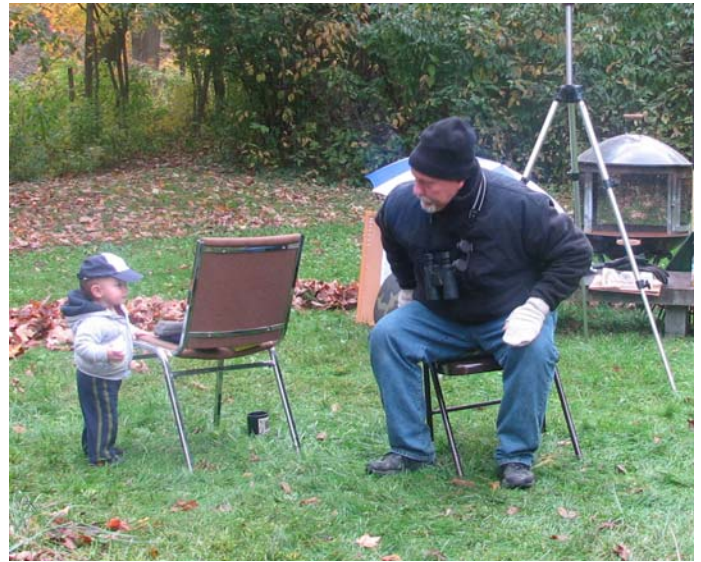
Beginning birder at his first Big Sit.