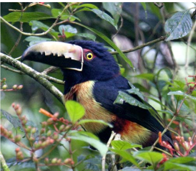
Collared Aracari.