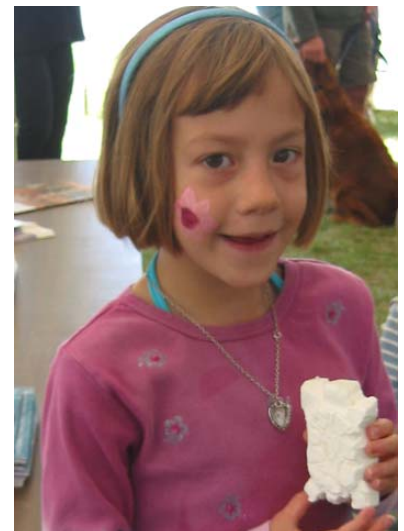
A beginning soap carver shows off a carved turtle.

Enjoy other activities, which include a nature walk, bird banding, and impromptu birding.