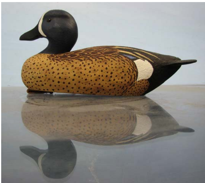
Blue-winged Teal (cork and wood) by Leo LaBonte