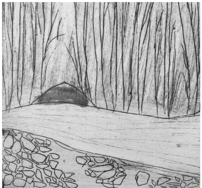
between earth and sky (intaglio, 6x6 inches) © Lori Hinrichsen , used by permission