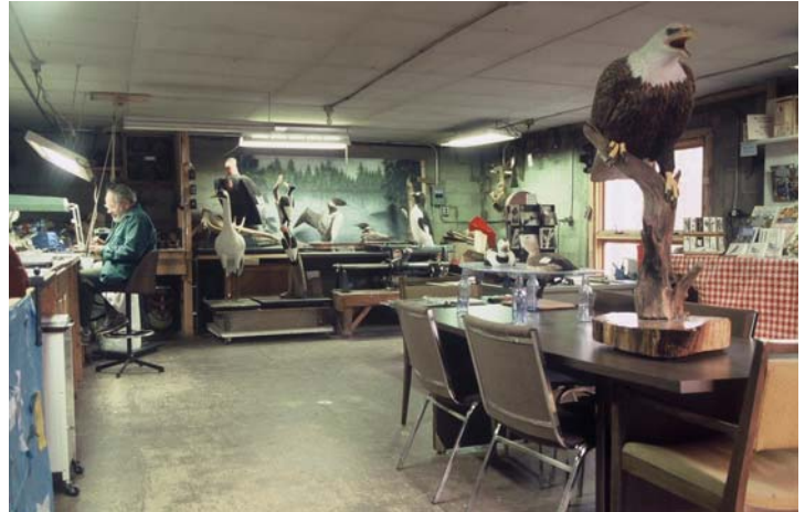
Bob carving in his workshop in the late 1980's. The giftshop is visible on the right of the photo.

We invite you to come share your memories, your photographs, and your stories while celebrating Bob's 91 1/2 birthday. We will enjoy a slide show of the museum's continuing story, reminisce with new and old friends, and of course eat cake on the evening of August 13th from 7:00 - 9:00 pm. 🐦