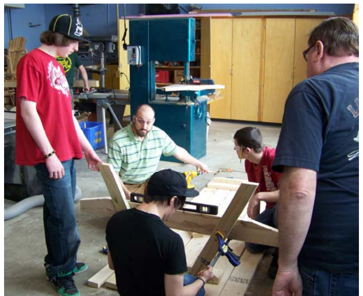
Sophomores learning construction techniques at the Center for Technology

The pre-tech class also donated bird feeders. We plan to use them for children’s programs and to place around the Museum. Thank you!