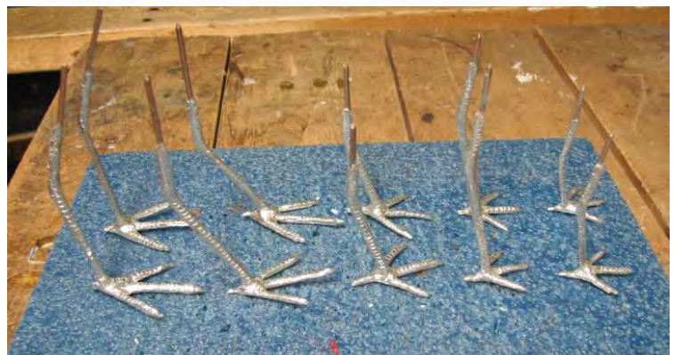
Bob Spear made legs for five species of shorebirds that will be carved and painted in their fall plumage.