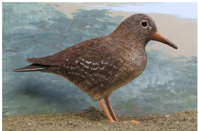
This carving of a Purple Sandpiper took Bob Spear 37 hours to complete.

Green Mountain Club's Nature Guide to Vermont's Long Trail by Lexi Shear