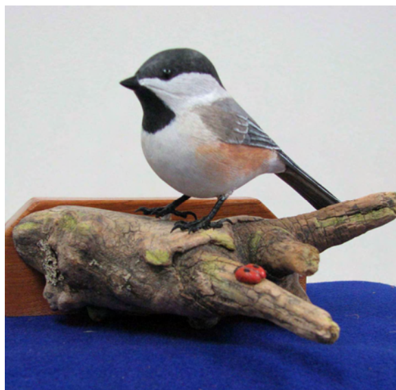
Black-capped Chickadee carving by Dick Allen.

Winning tickets will be drawn at 4:00 on May 16. Tickets are on sale now and can be purchased by phone, at the Museum, or on the day of the event.