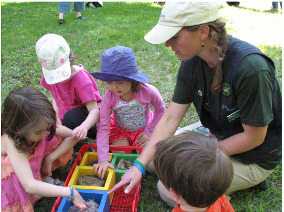
Children enjoy learning about nests at International Migratory Bird Day.

The Birds of Vermont Museum was recently recognized along with 35 other organizations for hosting International Migratory Bird Day events for 10 years.