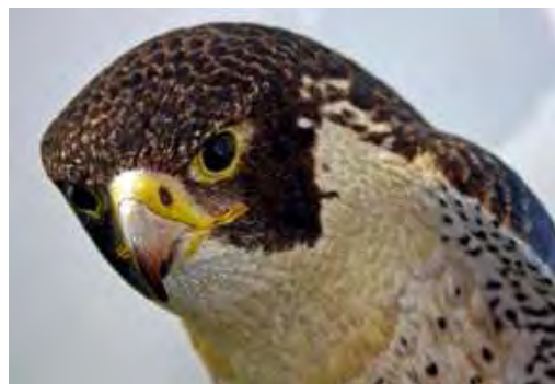
Peregrine Falcon wood carving by Bob Spear.