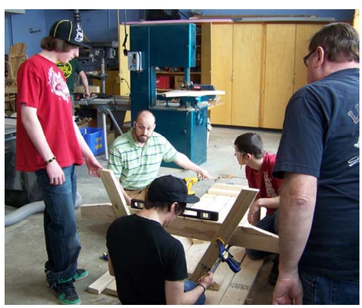
Sophomores learning construction techniques at the Center for Technology

The pre-tech class also donated bird feeders. We plan to use them for children's programs and to place around the Museum. Thank you!