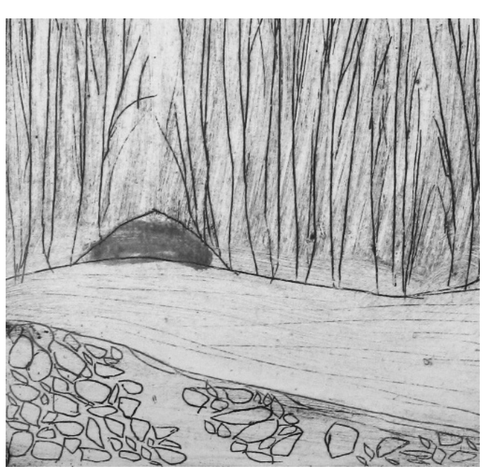
between earth and sky (intaglio, 6x6 inches) © Lori Hinrichsen , used by permission

The exhibit is free with admission to the Museum, and is open every day from May 1 – June 30. All are welcome.