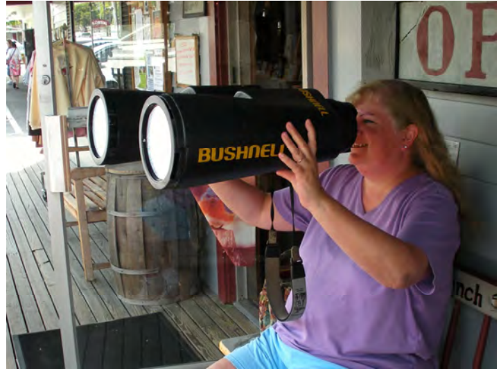
The dangers of addictions photo © 2012 Alaria Lanpher. Used by permission