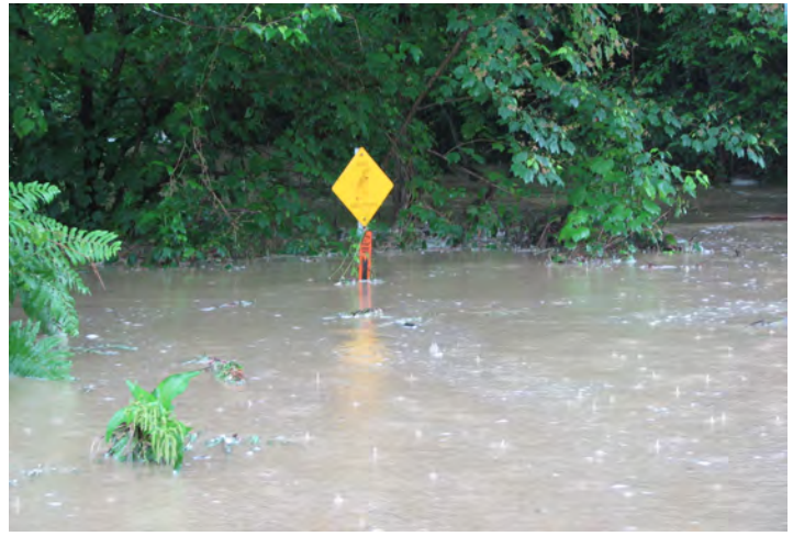
View across road: entrance to the trails

However, the truth is: the Museum faces a number of Continued on page 2