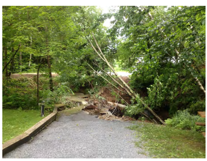
Now (July 2013)