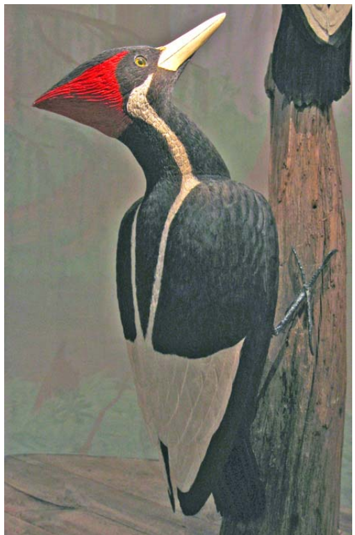
Male Ivory-billed Woodpecker carving by Bob Spear.