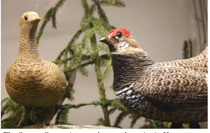
The Spruce Grouse is an endangered species in Vermont. One of the best places to find them is in the Nulhegan Basin IBA. Spruce Grouse wood carving by Bob Spear.

Examples of boreal habitat ,with its spruce-fir forests and mosaic of bogs and wetlands, can be found in some of Vermont's Important Bird Areas. Victory Bog Basin and Nulhegan Basin in Victory are both places where a birder might see species like Spruce Grouse, Gray Jay, Black-backed Woodpecker, and Boreal Chickadee. In the winter, it might be possible to see Purple Finch, White-winged Crossbill, and Pine Sisken.<sup>3</sup>