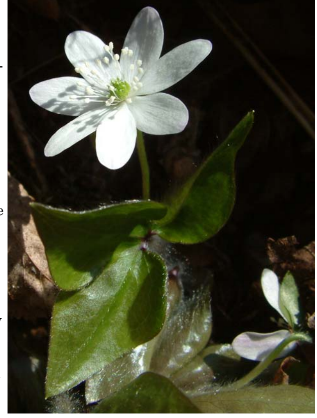
Sharp-lobed hepatica on the Birds of Vermont Museum property.